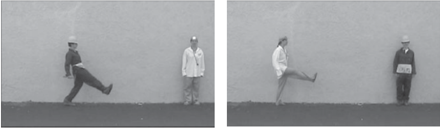
“The construction worker the doctor gippos.”

Fig. 3. A linking trial. Because both movies show approach actions, above-chance performance is only possible if linking rules have been learned.