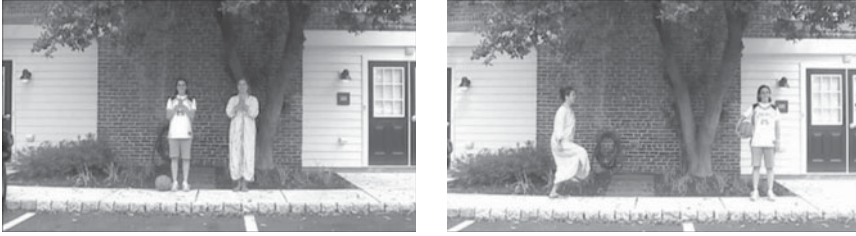
Fig. 2. Movies depicting approach and intransitive events were combined with different voiceovers to create either approach trials or intransitive trials. For instance, in an approach trial using the two movies shown above, participants would hear The princess the basketball player pookos , with the target movie to the right. In an intransitive trial they would hear The basketball player and the princess are zorping , with the target movie to the left.

required participants to listen to a voiceover sentence, then pick which of two simultaneously played movies depicted its meaning. The characteristics of the different trial types are described in more detail below.